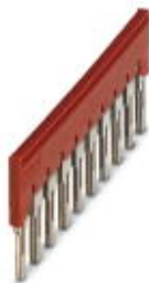
Plug-in bridge, pitch: 8.2 mm, width: 80.3 mm, number of positions: 10, color: red

Please be informed that the data shown in this PDF Document is generated from our Online Catalog. Please find the complete data in the user's documentation. Our General Terms of Use for Downloads are valid ( http://phoenixcontact.com/download )